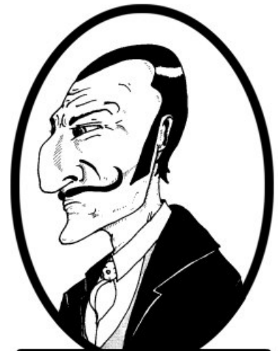
The fiendishly clever and diabolical Sir Walter Outrage

His wealth and devilish cunning have enabled him to deftly evade the law thus far, but will our intrepid heroes and heroines be able to prevent his next nefarious plan?