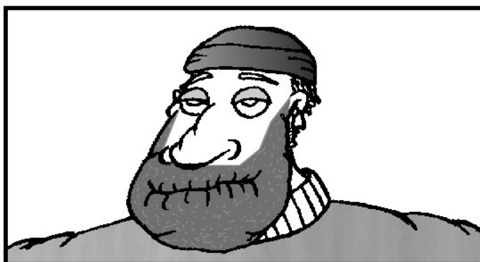
One of Outrage's Henchmen

The PCs may choose to inform the police, or to follow things up themselves. Whatever preparations they would like to make should be accommodated and elaborated upon. Should Juliette wish to go along, the handout at the end of the scenario may be of use - it informs the player that Juliette has access to disguise supplies, should she wish to go in the guise of a man. Having her present disguised as a police officer is particularly apt, and can lead to some hilarious results. The chapter title is to be used as a means of encouraging players to follow matters for themselves - as you would expect a roleplaying group to do.